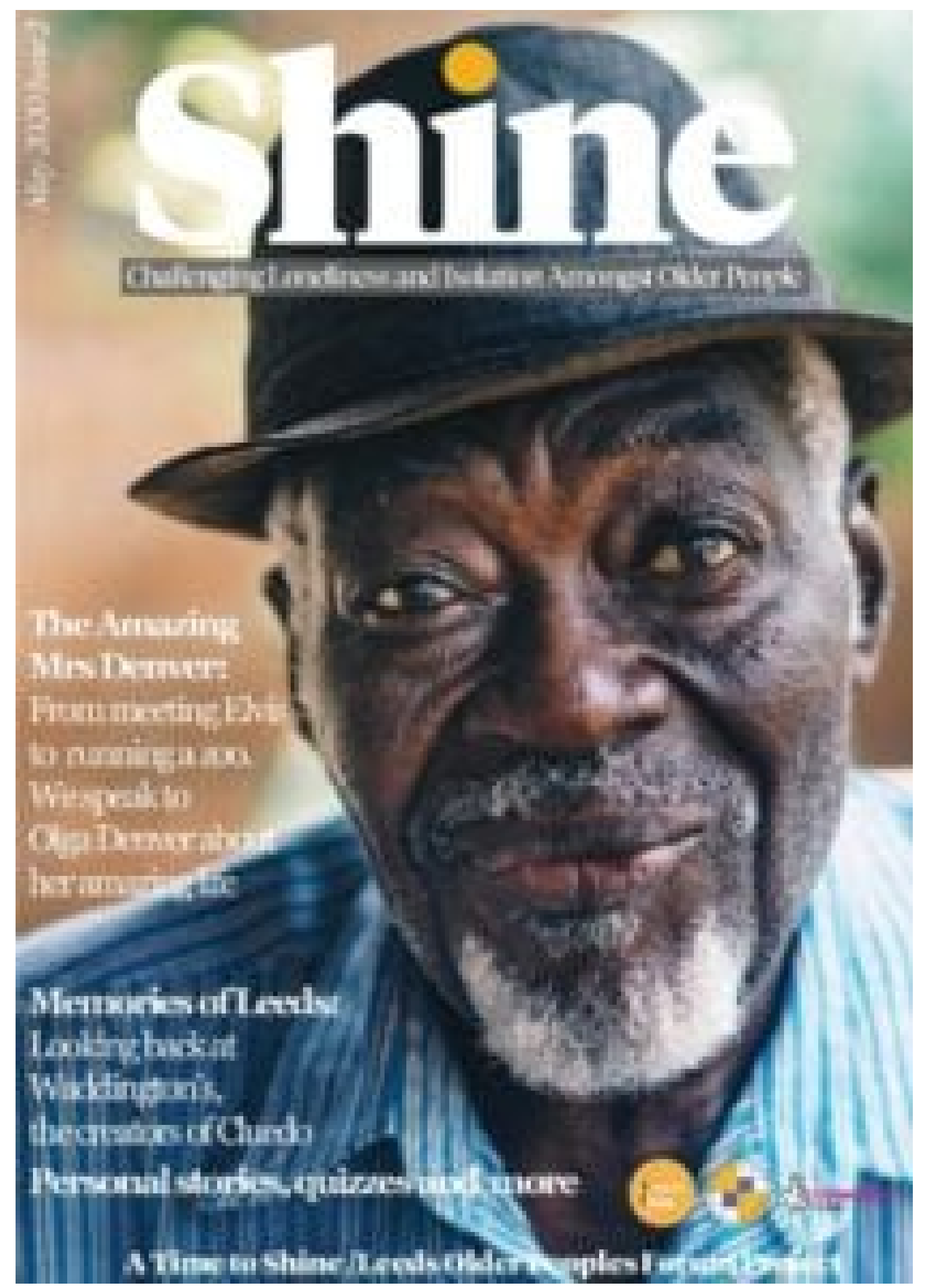
person's eyes; considering the best ways of doing that within this new digital world.